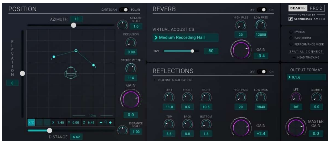
The dearVR PRO 2 graphical interface with XYZ position, early reflections, late reverb, and output sections

“Simulating distance in spatial audio productions is essential when creating truly authentic 3D spaces. Just one spherical plane with a fixed distance around the listener will not do the trick,” says Dear Reality co-founder Christian Sander. “dearVR PRO 2’s distance simulation unlocks a fully natural depth perception for multi-channel formats and lets the user place the sound seamlessly – even behind the loudspeakers.”